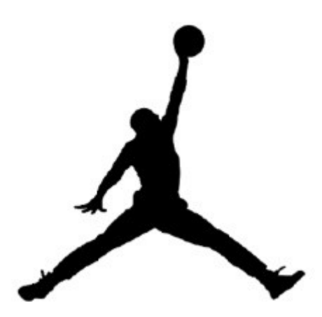
Nike's Jumpman logo